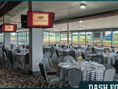
DASH FOR CASH